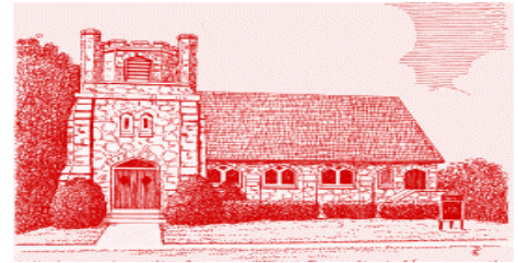
"The Little Stone Church That Rocks"

Brookfield Unitarian Universalist Church 9 Upper River Street, P.O. Box 386, Brookfield, MA 01506 buuc01506@gmail.com , www.buuc.org , 508-867-5145