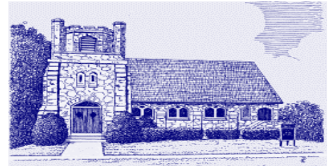
"The Little Stone Church That Rocks"

Brookfield Unitarian Universalist Church 9 Upper River Street, P.O. Box 386, Brookfield, MA 01506 buuc01506@gmail.com , www.buuc.org , 508-867-5145